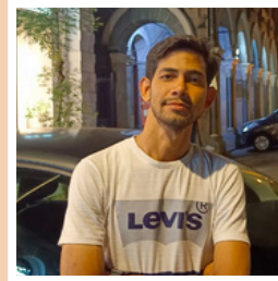
GAYAS AC TECHNICIAN ENGINEERING SERVICES