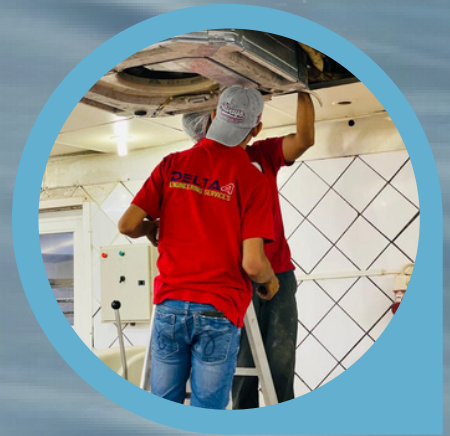
Service & Repair